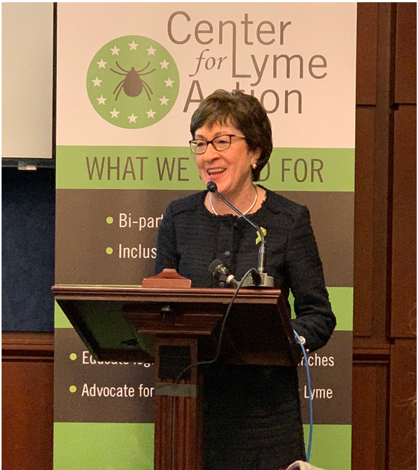
Senator Susan Collins